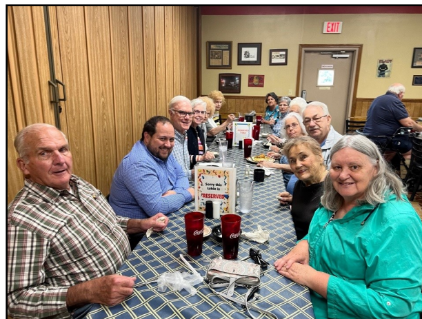
POGS at Shealy's enjoying lots of good food.