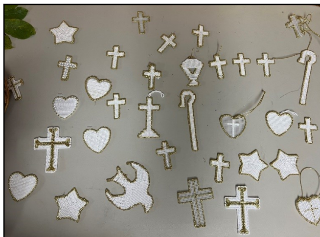
New Chrismon Tree decorations made at the WELCA Retreat.

All adults are invited to be a part of POGS! So, join us on Wednesday, November 9, for a time of good food and fellowship and for this special time to honor our veterans!