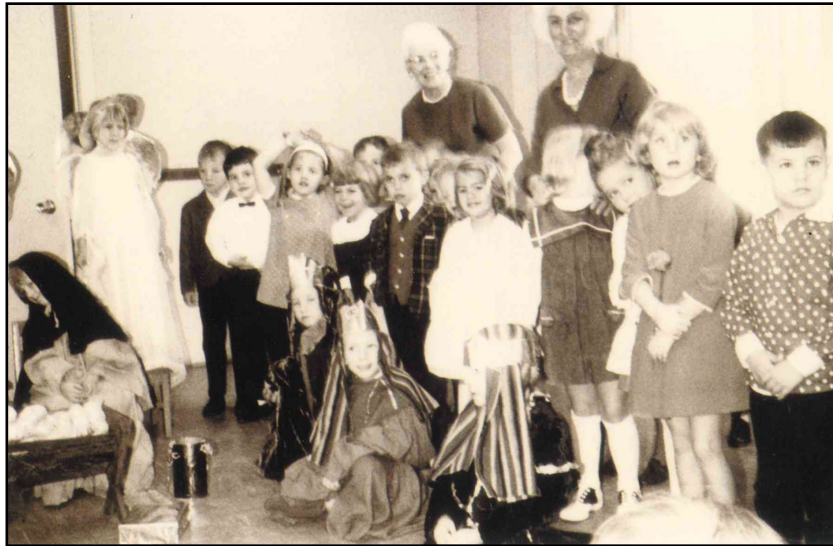
Looking back to 1964 when children were getting ready for the Children's Christmas Program.