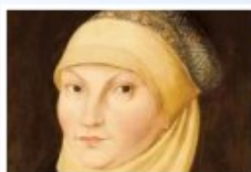
Bold Woman of Faith

N NEWBERRY COLLEGE SC WELCA Nursing Endowed Scholarship