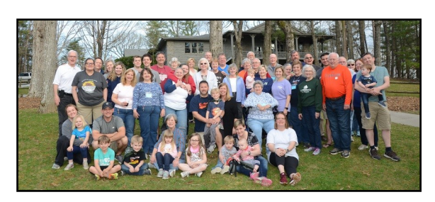
2022 Congregational Retreat at Lutheridge February 11-13, 2022